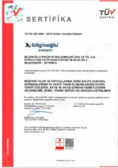
ISO 9001: 2015 Certificate